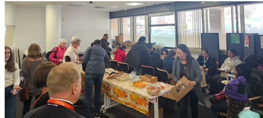
ELL volunteers and participants celebrate Thanksgiving together