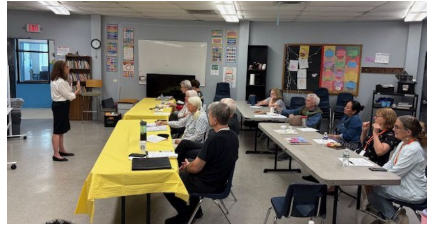
ELL Volunteer Training Session