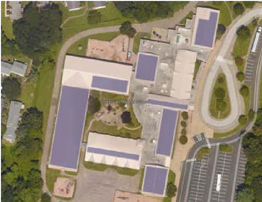
Westover Elementary School