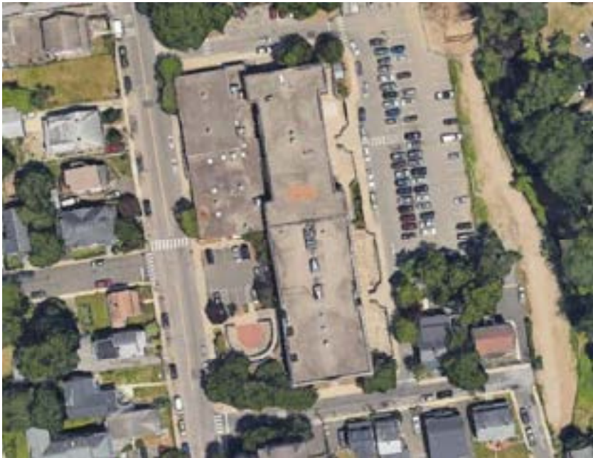
Hart Elementary School