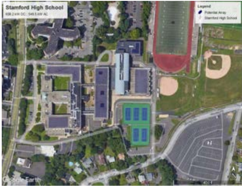
Stamford High School