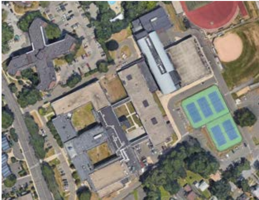
Stamford High School