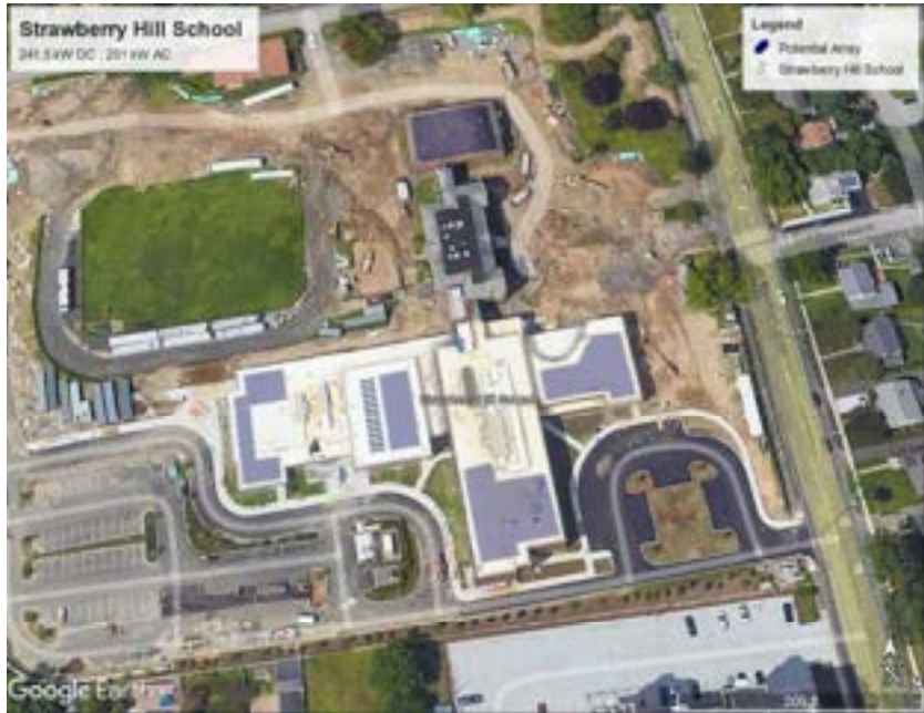
Strawberry Hill School