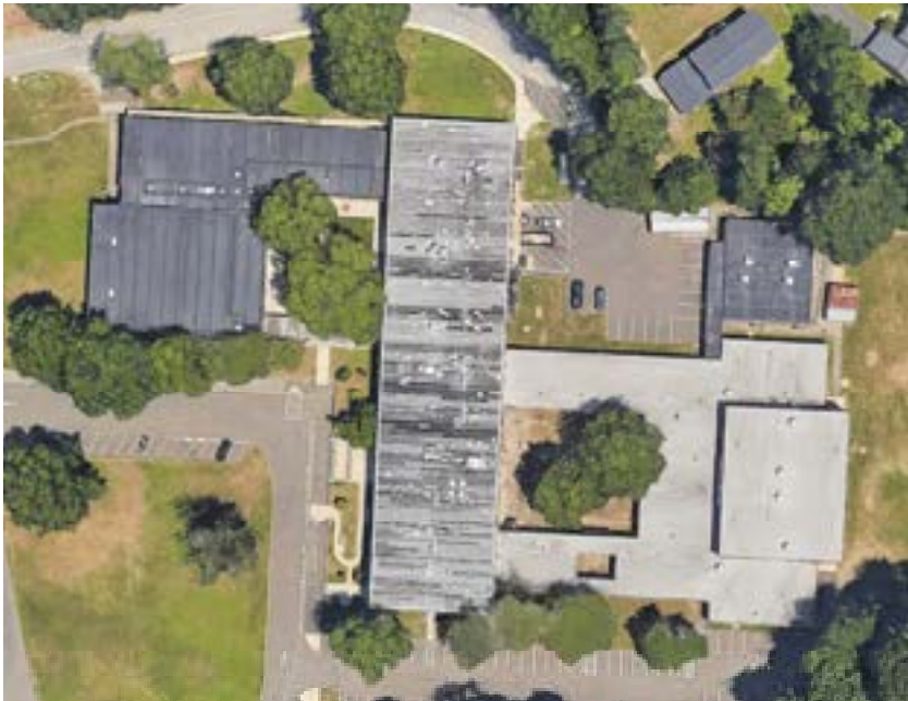
Turn of River Middle School