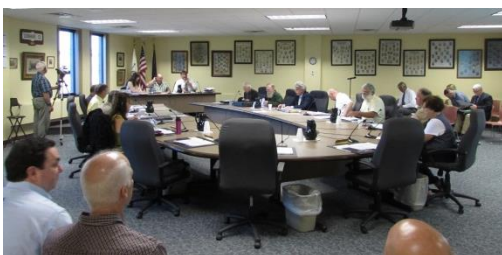
Schoharie County, NY