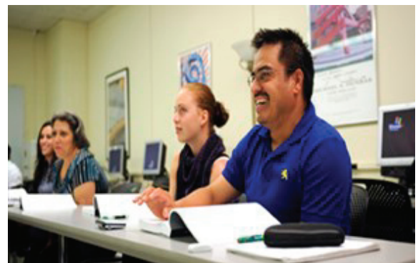
Adults engaged in an English class with Family Centers Literacy Volunteers.