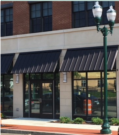
Close-up view of Park 215 commercial space from Stillwater Avenue.