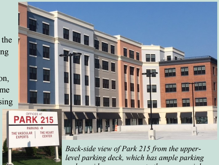
Back-side view of Park 215 from the upper-level parking deck, which has ample parking and provides easy access to the commercial space.

Showings may be scheduled for the residential portion, which contains 78 one- and two- bedroom mixed-income – affordable and market rate – apartments. COC is leasing the affordable units, with information available at https://www.charteroakcommunities.org/assets/uploads/Park-215.pdf . For information on the market-rate rentals, please call Newbridge Properties at (203) 324-1300 or email info@newbridge-properties.com .