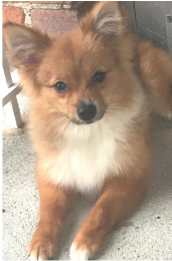
Riley pauses in his playing just for a moment to pose for the camera.