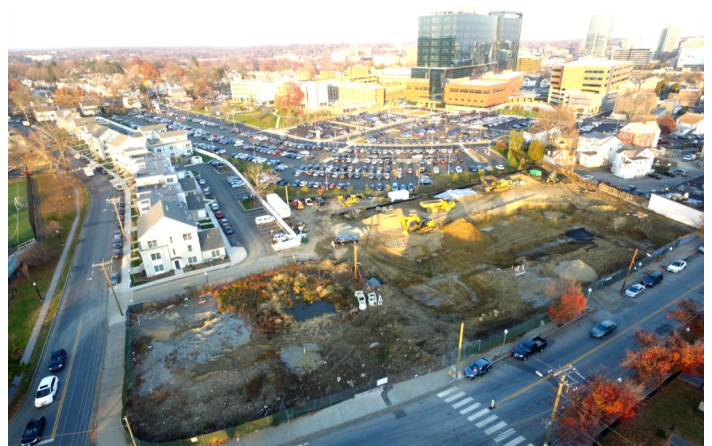
Future site of Park 215, located on Stillwater Avenue at the corner of Merrell Avenue. Aerial photograph courtesy of Viking Construction.

The meeting will begin at 6:00 p.m. at Post House, 40 Clinton Avenue in the first-floor meeting room.