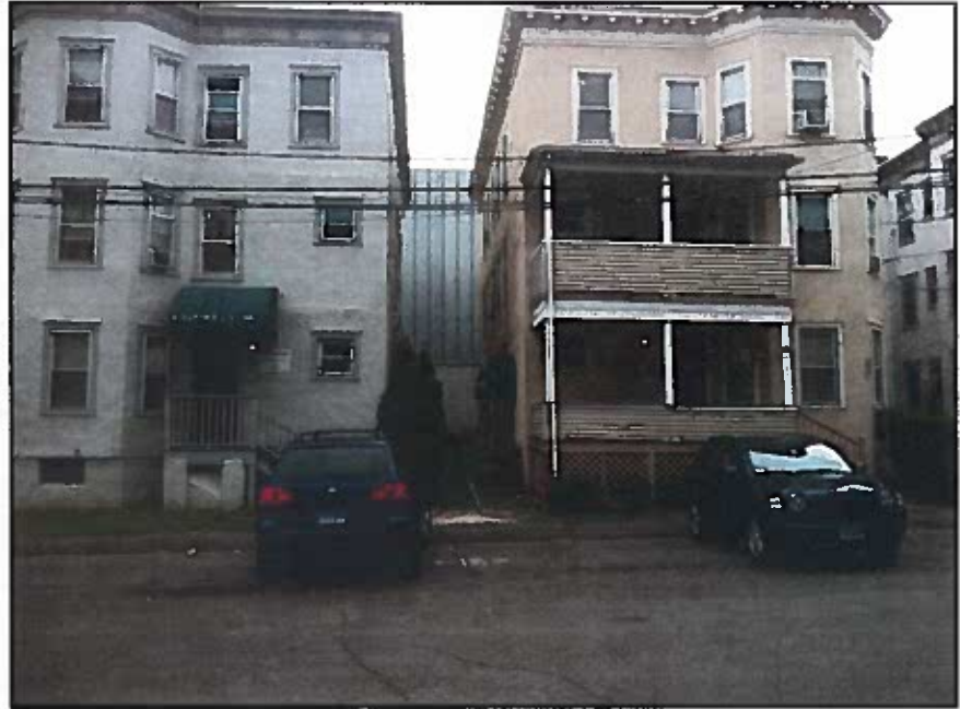
City-owned land between 1315 and 1351 Washington Blvd.