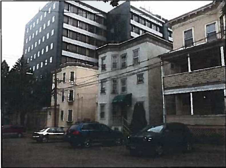
4, 8 and 12 Stanley Ct. with 1351 Washington Blvd. in background