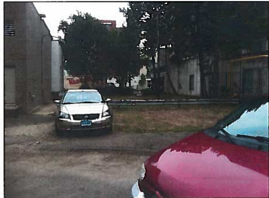
City-owned land between 1315 and 1351 Washington Blvd.