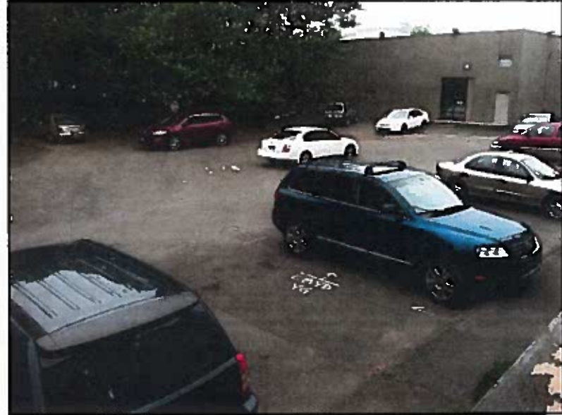
Rear of 1315 Washington Blvd. looking across cul-de-sac