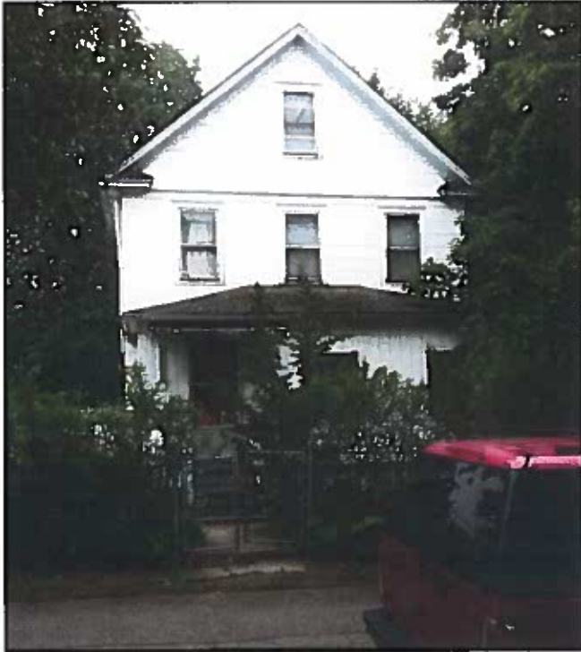
15 Stanley Ct.