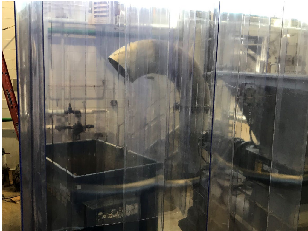
New Screenings Grinder, Washer, Compactor