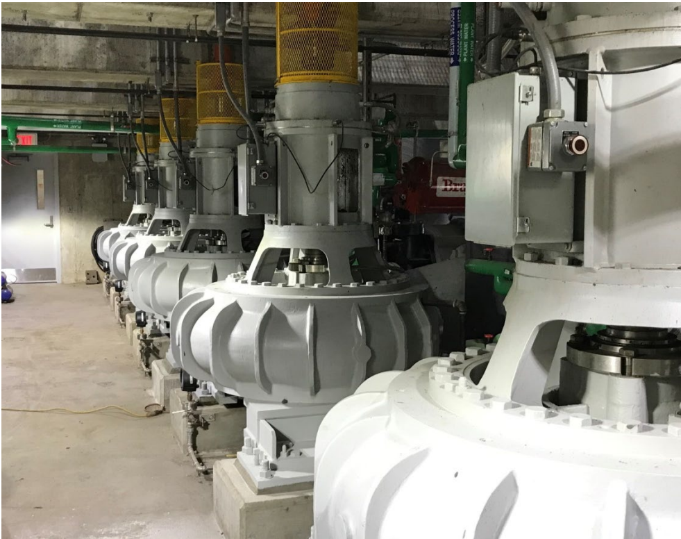
Five (5) New Raw Sewage Pumps